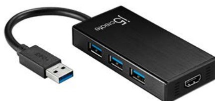
JUH450 HDMI & 3-Port HUB