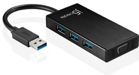
JUH410 VGA & 3-Port HUB