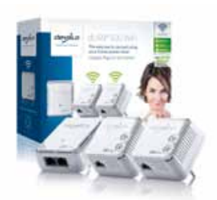
dLAN® 500 WiFi Network Kit