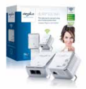
dLAN® 500 WiFi Starter Kit